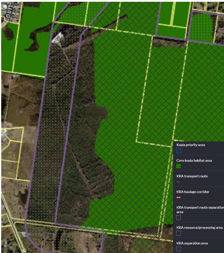
Figure 1: Example of an area that is in a key resource area and is mapped as containing a koala habitat area that is outside of a koala priority area