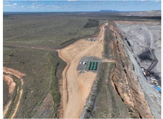
There will be no additional surface disturbance as a result of our proposed Mavis South Underground. The existing infrastructure (shown here), WILL NOT be added to.