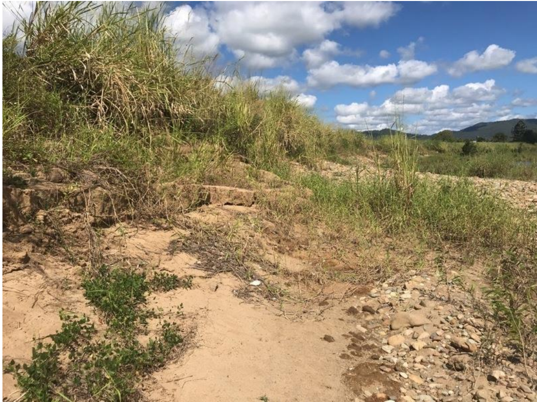
Figure 11 - Erosion at a St Helens Creek site before works

During the North Queensland Monsoon Trough in 2019, St Helens Creek was impacted by major flooding, with flood waters covering up to two thirds of the pile field sites. All sites on St Helens Creek held up well during the flooding and demonstrated increased resilience in the region from the investment.