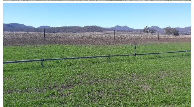
Figures 14 and 15 - The active gully head area before and after NDRRA battering and revegetation