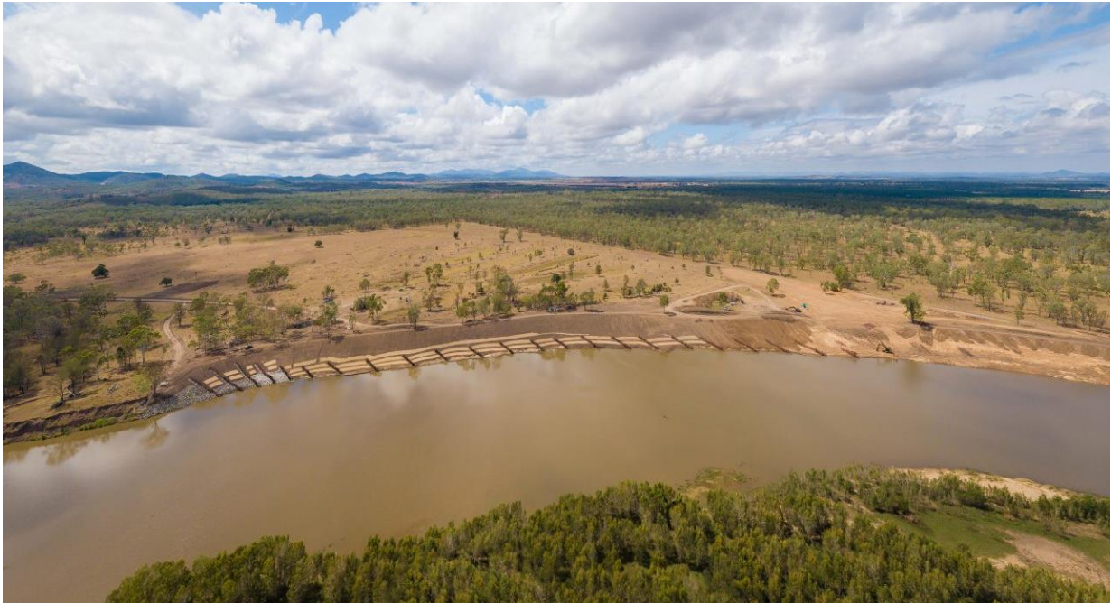
Figure 5 - Aerial image of the stabilised streambank at Site 7