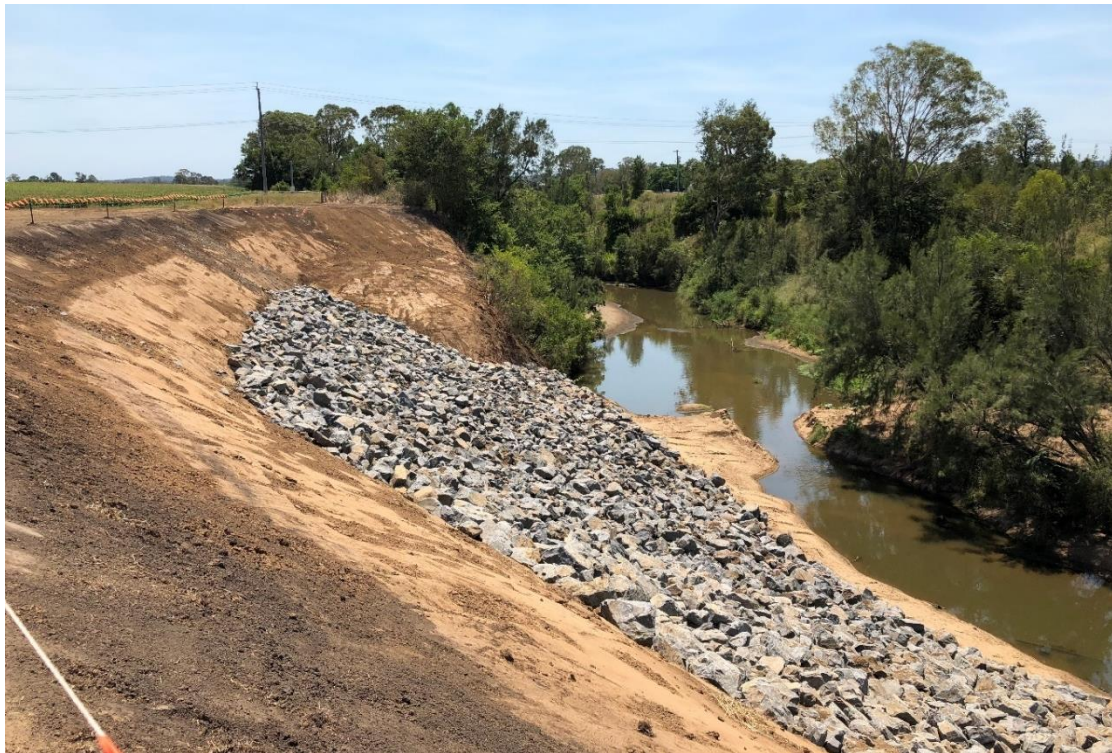
Figure 8 - Site ready for revegetation on the Logan River at Illbogan