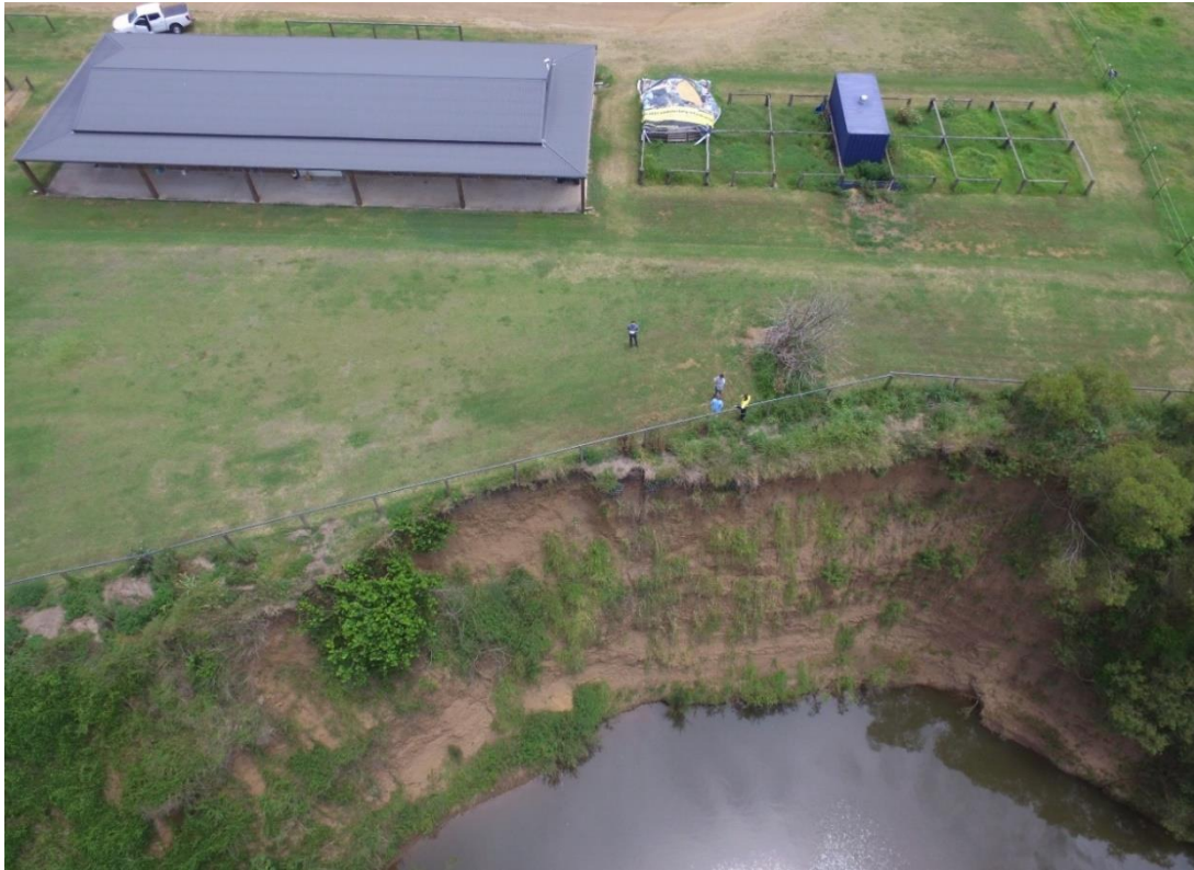
Figure 7 - Major erosion on the Logan River at Illbogan, before works