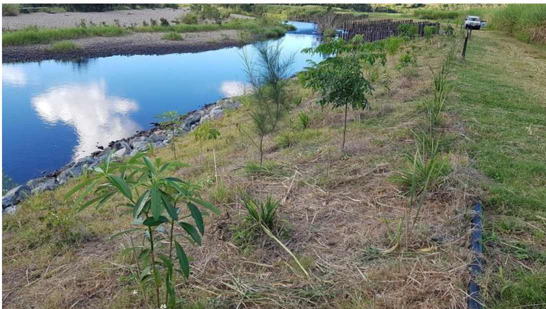
Figure 12 - Revegetation and pile fields at St Helens Creek site - post- works