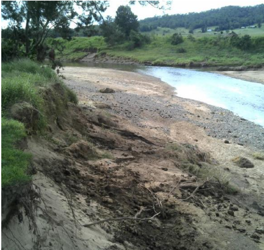
Figure 2 - Erosion caused by TSC Debbie at the Elliot Site