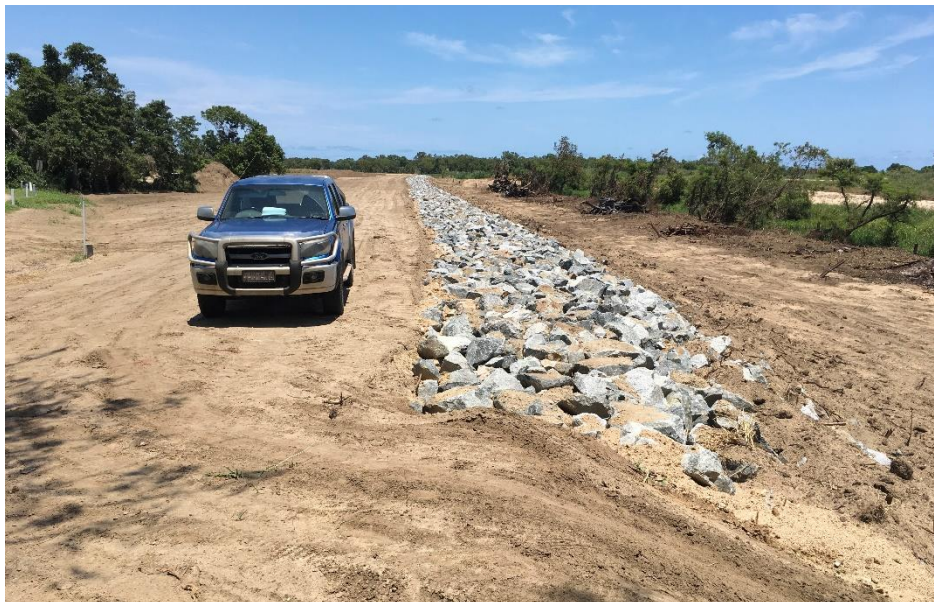
Figure 2 Reibel's bank works ready for revegetation

During the North Queensland Monsoon Trough in 2019, the works funded under the STC Debbie NDRRA Environmental Recovery Package held up during flooding, demonstrating the enhanced resilience in the catchment produced through the investment (Figure 10)