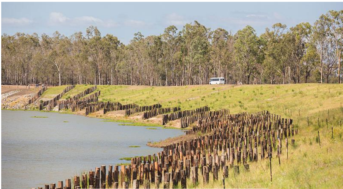
Figure 6 - Site 7 on the open day, October 2019