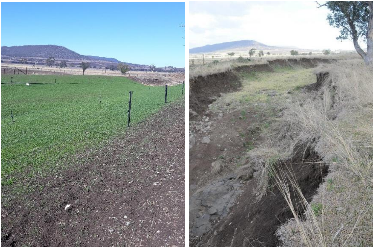
Figure 17 - The channel transformation as part of the NDRRA environmental recovery package