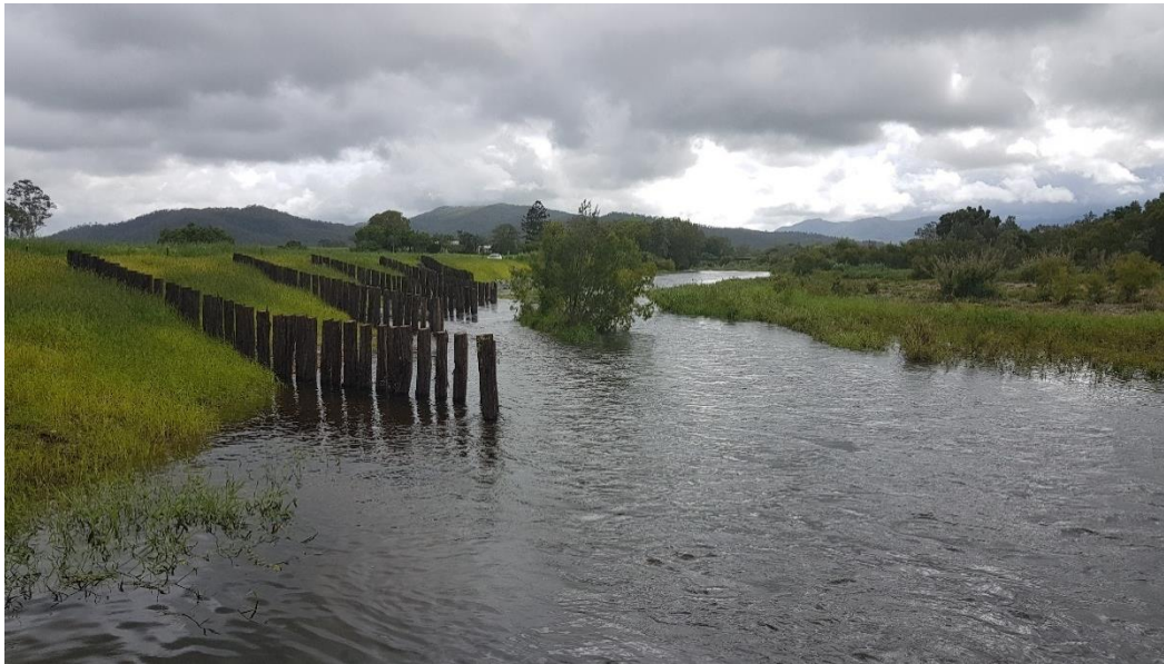
Figure 13 - St Helens Creek site during the 2019 North and Far North Monsoon Trough