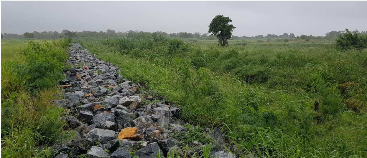
Figure 10 - Reibel's bank works after the 2019 North and Far North Queensland Monsoon Trough