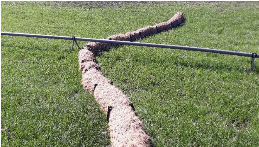
Figure 16 - A series of 4 degradable coir log weirs installed to further stabilise the channel bed