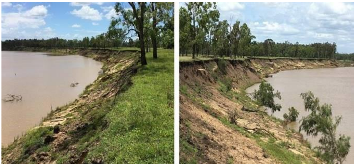
Figure 4 - Erosion at Site 7 before works

It is estimated that this project will save 90,000 tonnes of sediment from entering the river system annually, with long-term benefits to not only the local waterways but also to the health of the iconic Great Barrier Reef.