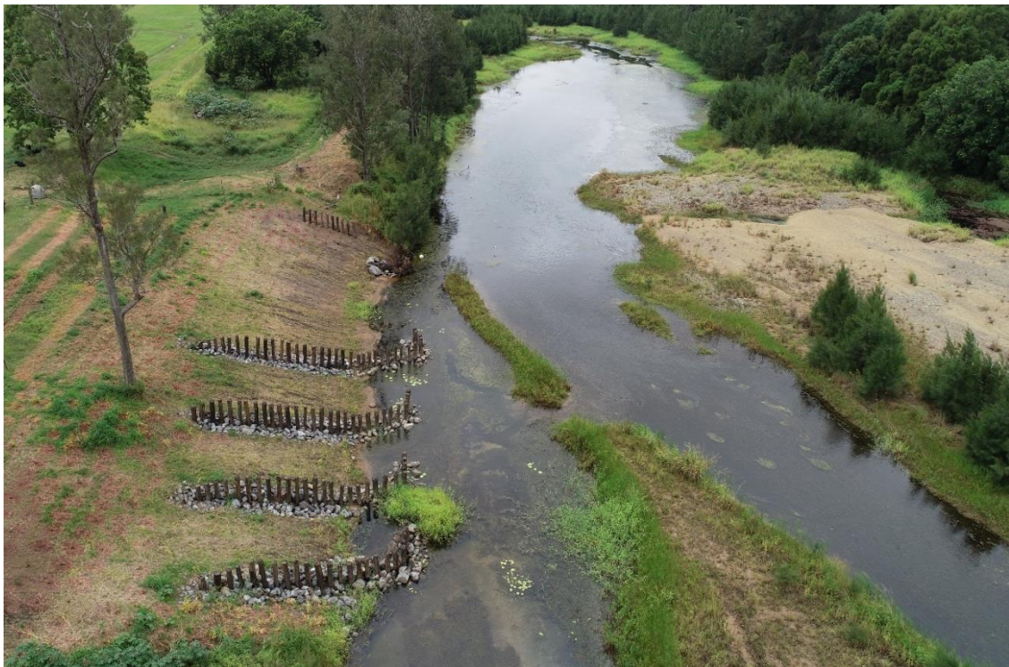
Figure 3 - The Boundary Site in February 2019 - Post on-ground works